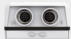
Mini-Din connections for Pt100 probes