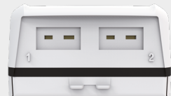
Connectors for thermocouple probes